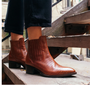
Briggs, $175.00, Rooster Shoes, 105 Osborne Street