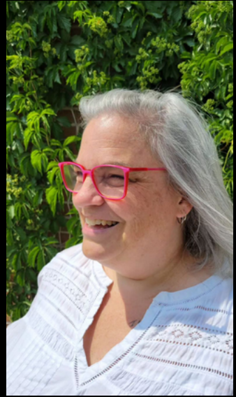
Eyes in the Village is located at 134 Osborne Street

The list goes on! For all of your legal needs, visit Fehr Manghebari Law (222 Osborne Street) and for help with your taxes, visit Liberty Tax Service (194 Osborne Street). More than shopping and eating, Osborne Village is for living—it's the perfect place to get things done. A wide variety of businesses are just a stone's throw from one another, making Osborne Village one of the best places in the city to support local businesses and to live an active (car-free) lifestyle.