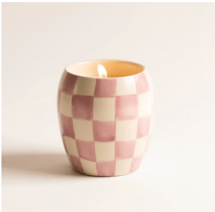
Checkmate Candle, $65.00, Small Mercies, 111 Osborne Street

This cozy season, make your home your happy place. Osborne Village shops have everything you need to stay warm as the weather outside cools. Glowing candles, hot tea, and summery plants are all available at our local retailers. Here are some of our favourite fall finds: