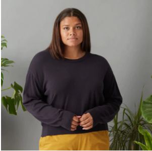
Palmer Sweater, $39.99, Out of the Blue, 102 Osborne Street

As we head into cooler temperatures, we can take comfort in all things cozy. It's time to grab a fall Cascara Spice Latté from Little Sister Coffee Maker (433 River Ave), throw on a sweater from Out of the Blue (102 Osborne St), and take a stroll through the neighbourhood in your new fall boots from Rooster Shoes (105 Osborne St). Osborne Village has plenty of fashion retailers to keep you cozy and stylish this season. Here are some looks we're loving: