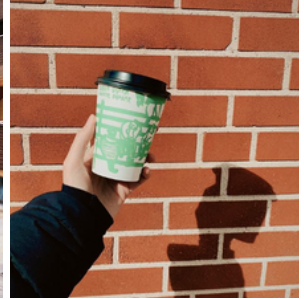
The Best Fall Accessory Little Sister Coffee Maker, 470 River Avenue