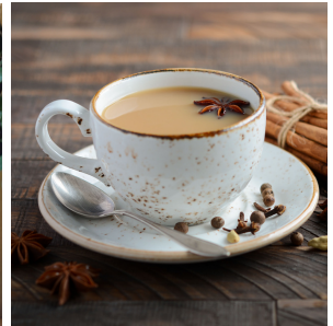
Chai 200g, $10.00, The Canister 121 Osborne Street